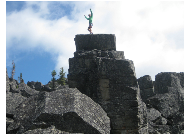
The Boulder Gardens